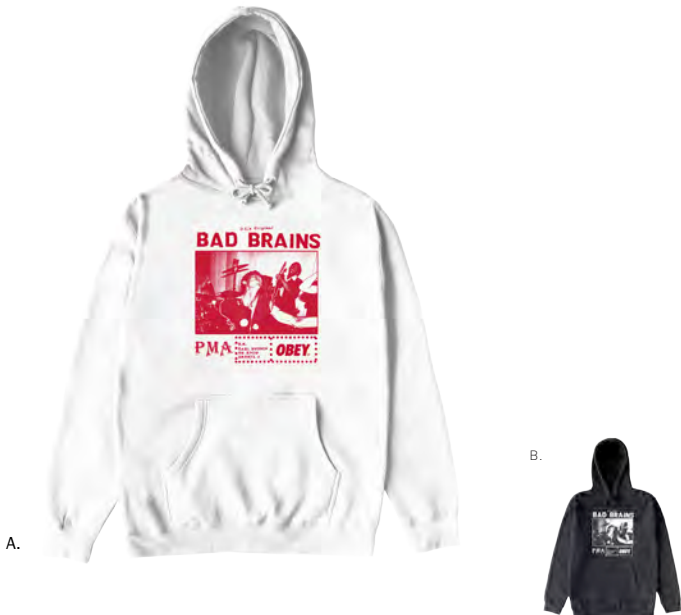
BAD BRAINS PMA PHOTO 111731265