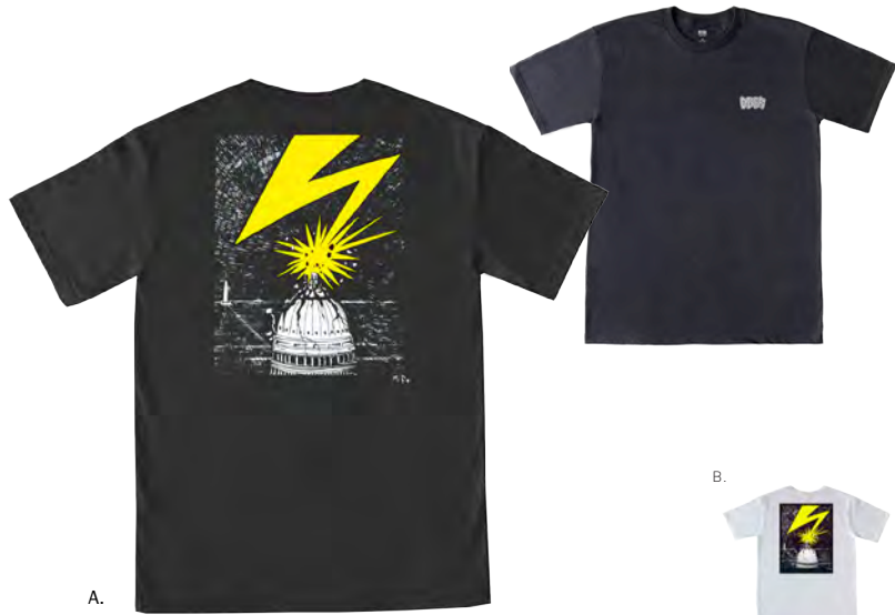
BAD BRAINS CAPITOL 165361263