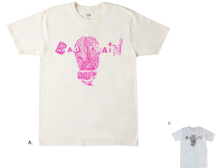
MIND POWER 165361266