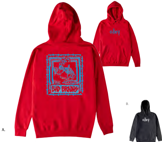
OBEY X BAD BRAINS SKELTON 111731268