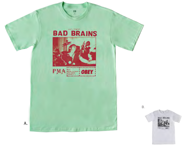
BAD BRAINS PMA PHOTO 165361265