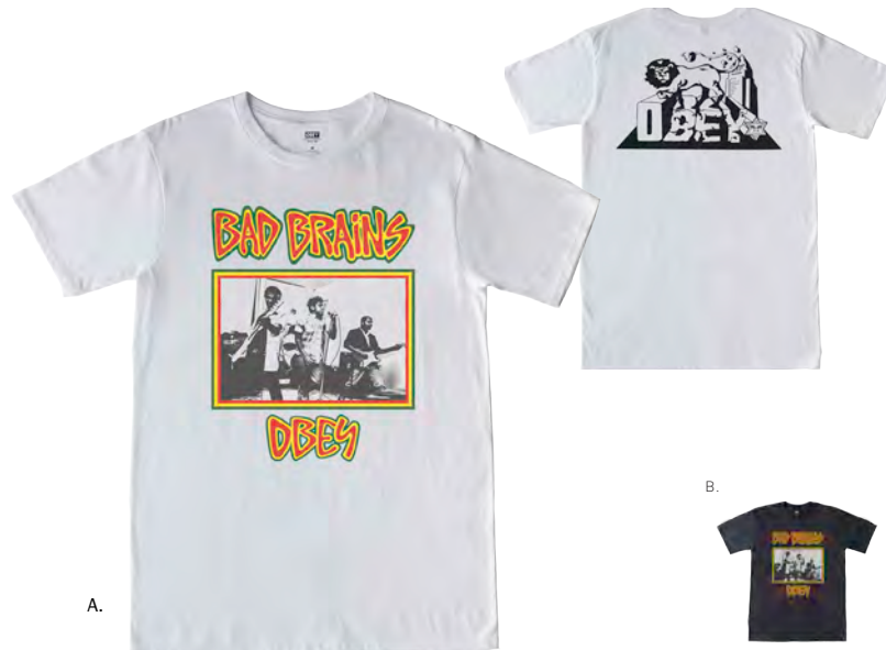
BAD BRAINS X OBEY 165361264