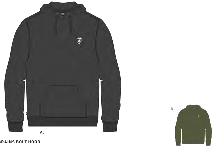
BAD BRAINS BOLT HOOD 111610055